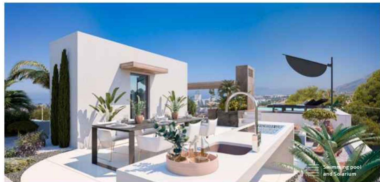
Swimming pool and Solarium

"The white and modern architecture reflects all the beautiful aspects of the Mediterranean, even inside the houses."