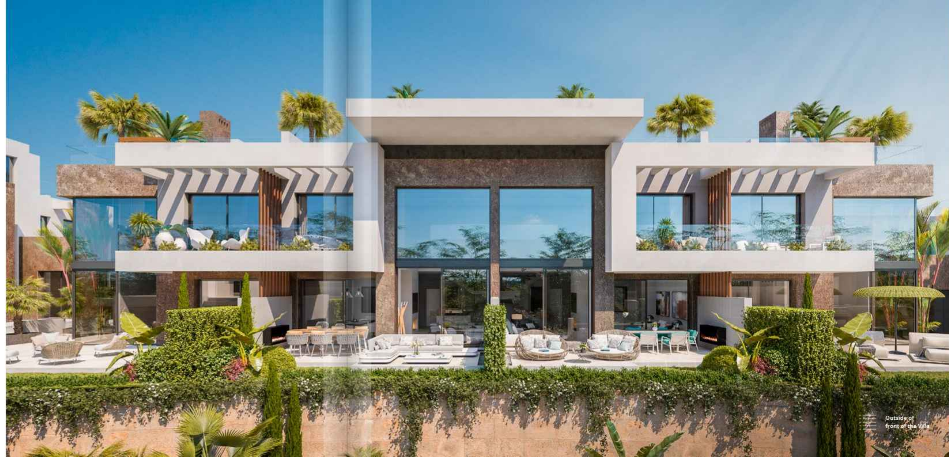
Outside of front of the Villa

The development will also have a gym which can be accessed from the upper floor of the communal terrace area. The gym will have a Turkish bath, sauna, massage room and changing rooms and toilets, one of which, will be specially adapted for disabled access.