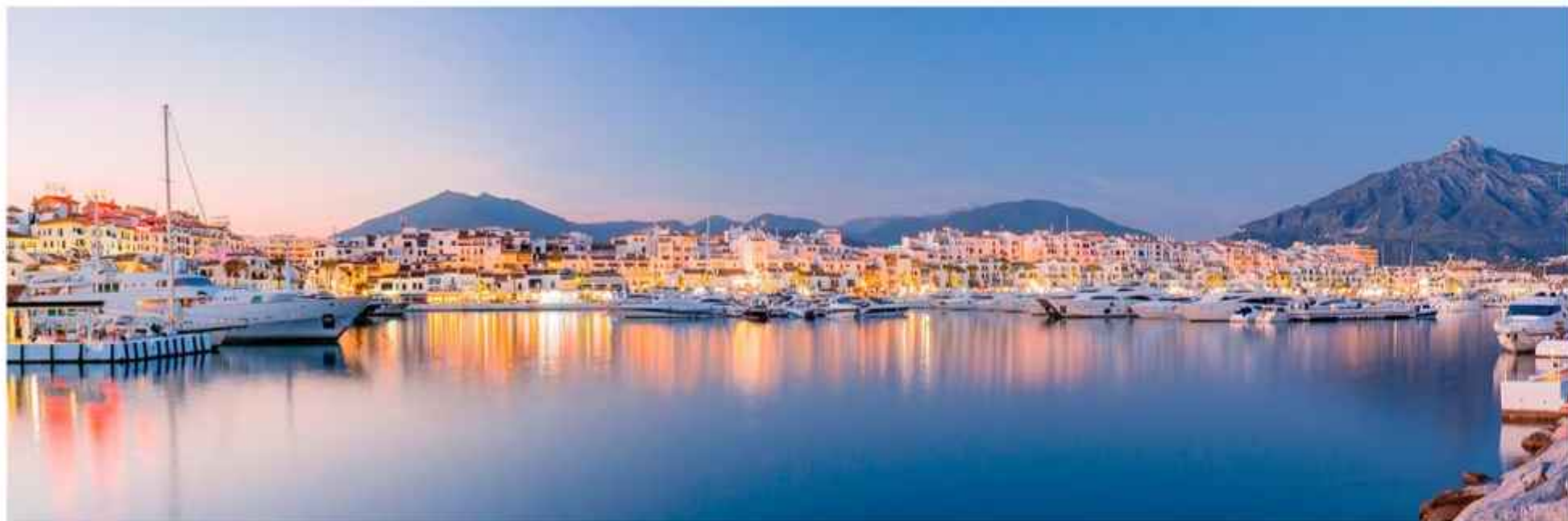
Puerto Banús, Marbella