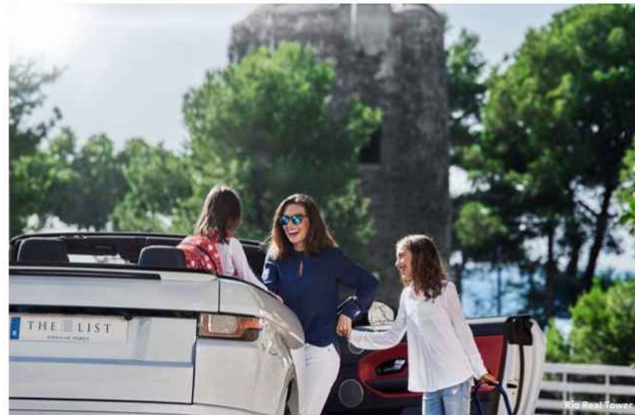
Río Real Tower

Beyond the gates of The List , we find a place known around the world for its high level of luxury and knowing how to live a lifestyle of exceptional quality. Marbella is currently entering a new era offering more to enjoy than just luxury living, warm climate and beautiful surroundings.