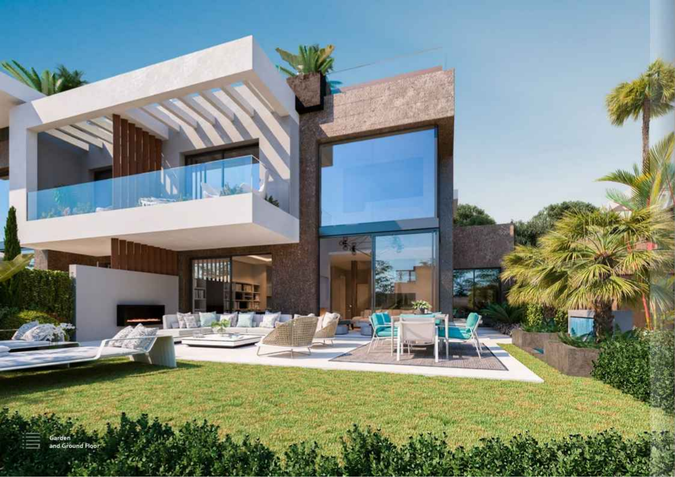
Garden and Ground Floor