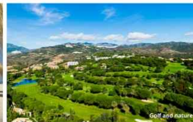
Golf and nature