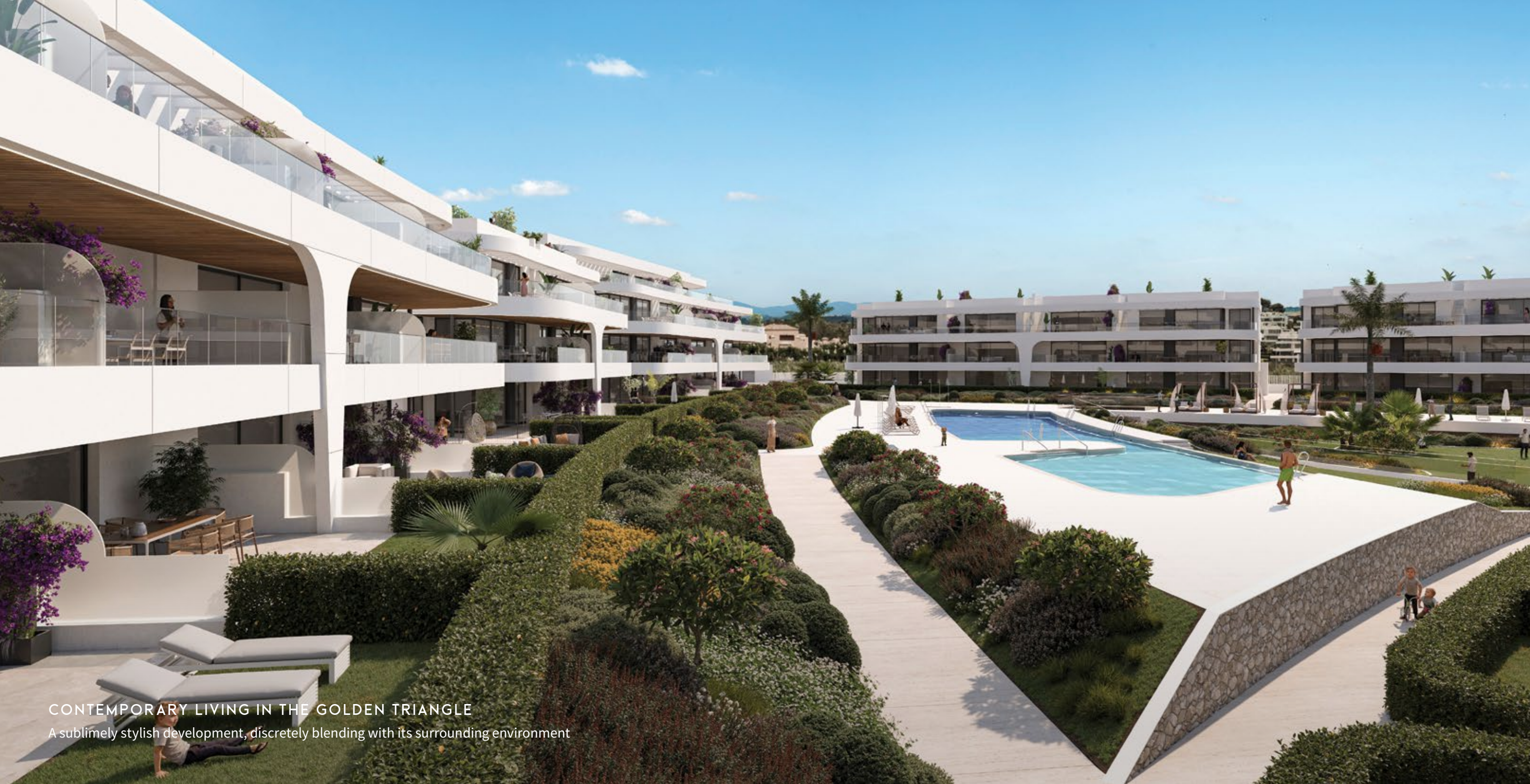
CONTEMPORARY LIVING IN THE GOLDEN TRIANGLE A sublimely stylish development, discretely blending with its surrounding environment