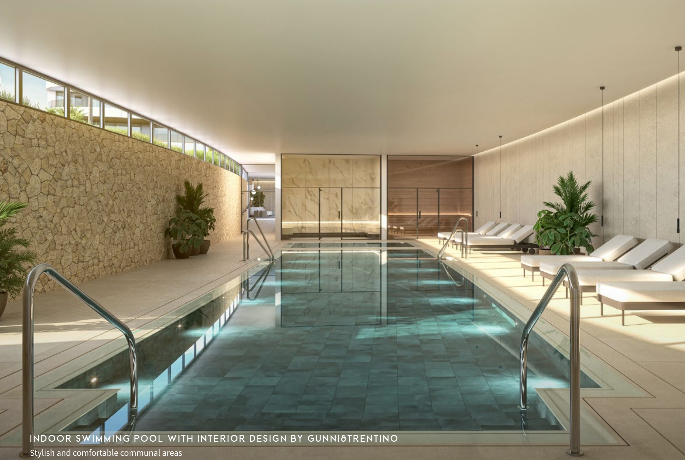
INDOOR SWIMMING POOL WITH INTERIOR DESIGN BY GUNNI&TRENTINO