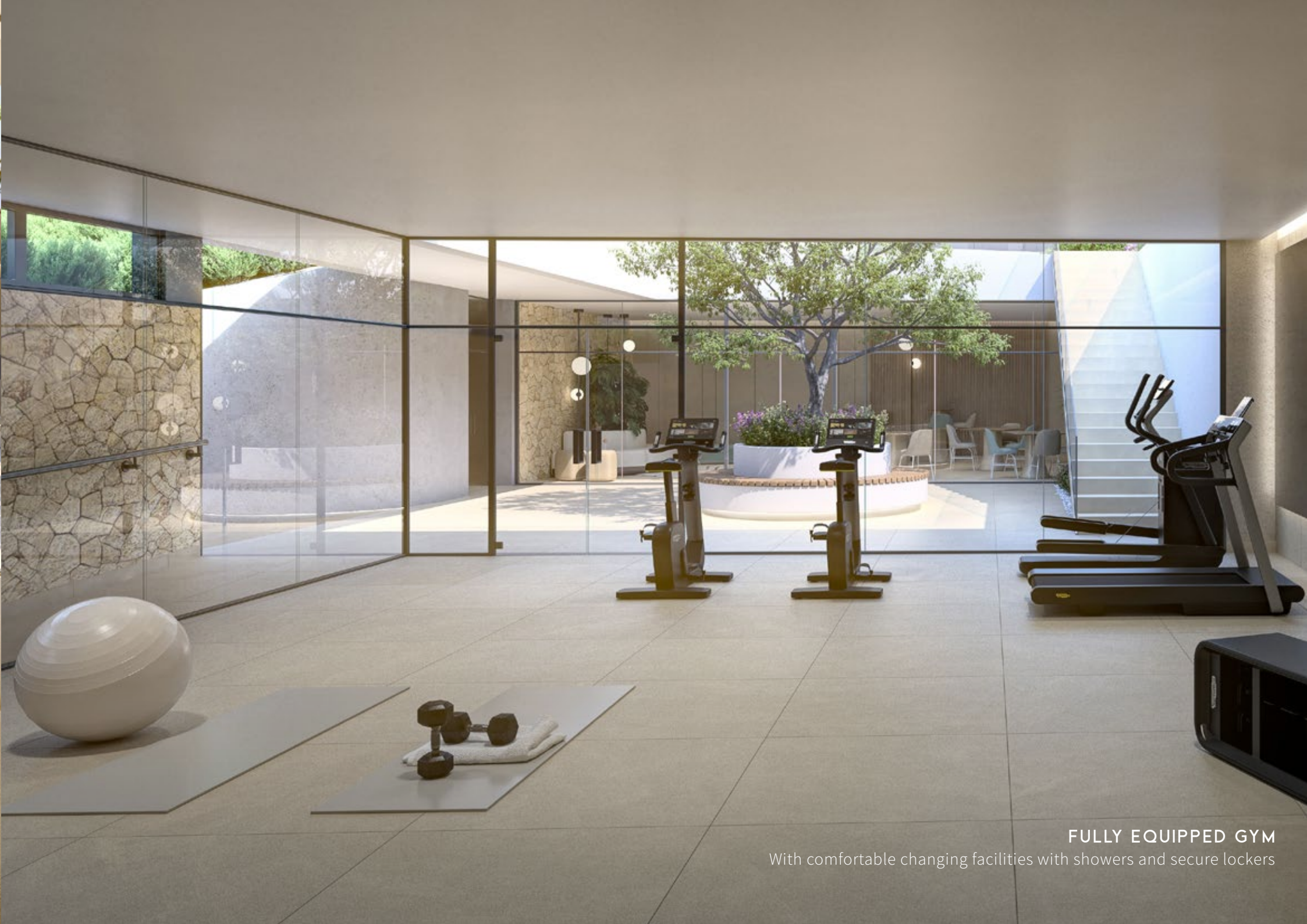
FULLY EQUIPPED GYM With comfortable changing facilities with showers and secure lockers